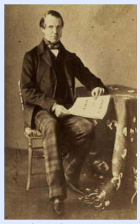
Earl Cowley 1804-84

Wanstead Flats was enclosed by fences from Bushwood to Ridley Road by Earl Cowley's agents, but in July 1871 a protest meeting against the enclosure was called on Wanstead Flats and thousands turned up. Despite the pleas of the organising committee the crowd refused to disperse after the meeting and in the evening began to break down the fences near the corner of Capel Road.